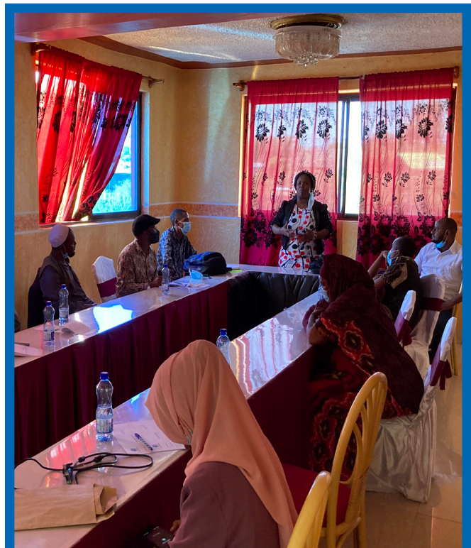
Isiolo, Kenya: A LPN that the SCN helped establish meets to reflect on the past month of delivery and to plan the next month of activities.

An LPN should have a clear and consistent Terms of Reference (ToR), or similar document, that outlines its mandate, structure, members' roles and responsibilities, modes for internal and external communication and decision-making processes. This will allow members to set up a clear internal modus operandi and ensure efficient, effective and transparent functioning of the team. Moreover, members should clarify where the LPN fits within the broader national and local prevention infrastructure to ensure other stakeholders are familiar with its remit and determine potential areas for collaboration. This facilitates the development of productive working relationships with institutions and civil society partners and avoids confusion as to the LPN's purpose.