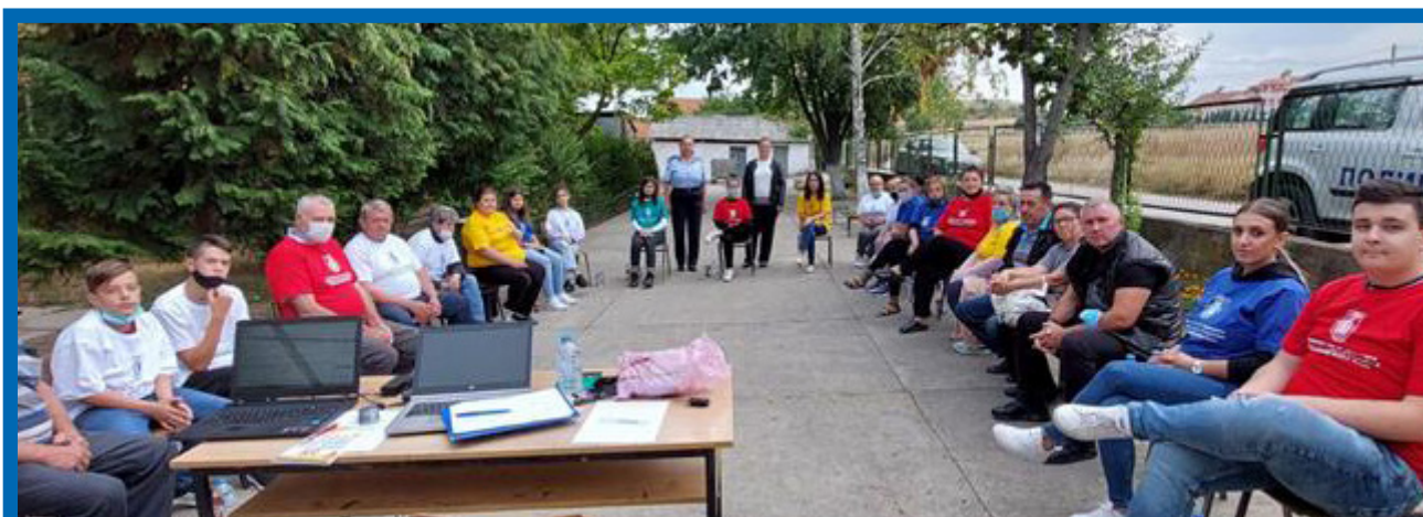
Kumanovo, North Macedonia: The SCN-supported LPN (known locally as the ‘Community Action Team’) holds a series of consultations with different neighbourhoods in Kumanovo to better understand residents’ perspectives of local threats and the infrastructure that can be leveraged to respond.

Depending on the capacities and expertise of their members, LPNs can directly implement and/or support and coordinate local initiatives and services. Direct delivery can range from the implementation of training, awareness raising or other capacity-building initiatives, to the provision of psycho-social support and trauma healing to those who would otherwise not seek these services from established institutions or pre-existing service providers, to supporting peaceful and credible elections. Equally important, the LPN can serve as a coordination mechanism for tailored interventions, referring individuals to service providers either within or outside of the network, should they require support that the LPN is unable to provide. Finally, LPNs can play an important role in involving local government and non-governmental stakeholders, including researchers, youth, religious officials and private sector representatives in the delivery of local action that strengthens community resilience and social cohesion.