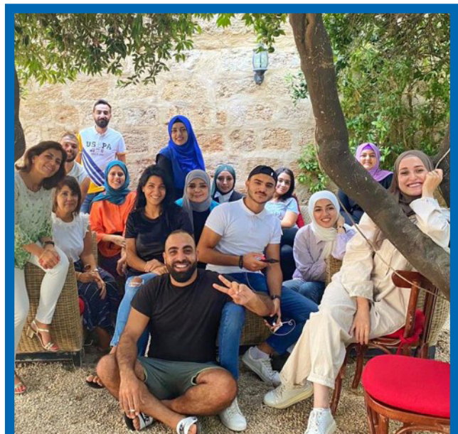
Tripoli, Lebanon: the SCN-supported LPN trains local youth on media literacy, including how to critically assess information consumed online and how to navigate the digital world safely.

The LPN's knowledge of the local context coupled with its proximity to members of the community, including the historically marginalised and excluded, allows them provide safe spaces and agency to citizens that otherwise may not feel that their voices are heard. LPNs can also prioritise outreach to specific constituencies, such as youth, and drive forward conversations around sensitive topics, such as destigmatising mental health and access to psycho-social support in locations that have historically been less understanding of them.